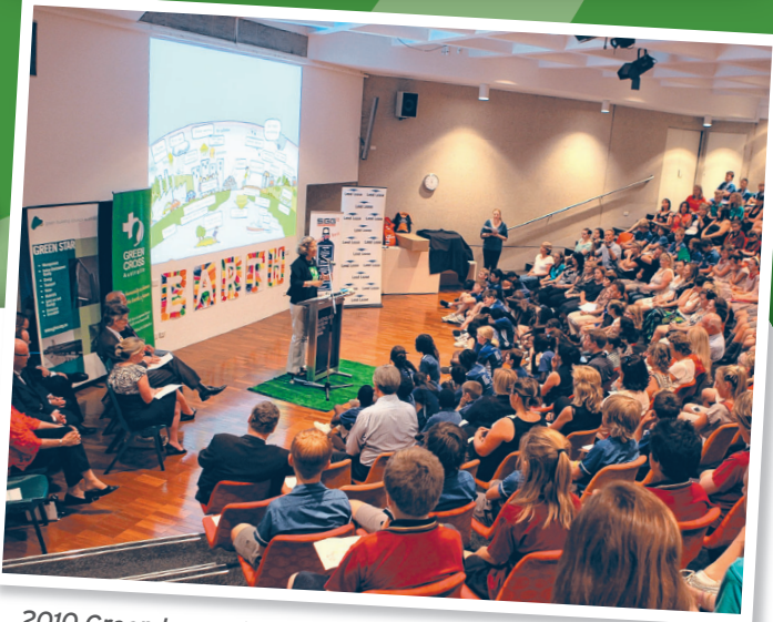
2010 Green Lane Diary Awards at the Queensland Museum

The diary is generously supported by Energen, SEQWGM, TravelSmart, CSIRO, Department of Environment and Resource Management, Department of Education and Training, Channel 10, SIGG Australia and ACT Sustainable Schools Initiative. Teachers can register their schools online now. Simply email your name, school, number of students, contact number and email address to info@greencrossaustralia.org