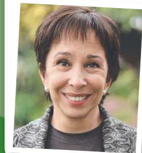
Princess Basma bint Talal Sister of the late King Hussein I of Jordan, Green Cross International Honorary Board Member

"It is because our problems have taken on such global dimensions that the implications for not responding to the problems are far greater. If the environment is not addressed, we implicate our survival on the planet. Equally, mass migration will place tremendous strains on our resources and cities. If living conditions are not improved for those in the developing world, if poverty is not alleviated and political unrest and upheavals calmed, then there will be implications for the most comfortable of industrialised countries. It is therefore everyone's business."