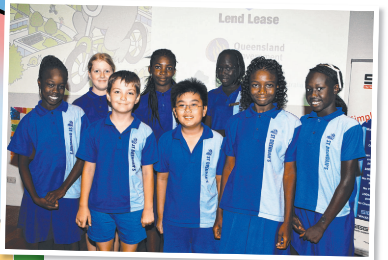
2010 Class Community Action Award Year 6 and 7 students from St Brendan's Catholic Primary School, Moorooka, made a difference last year. Their fundraising efforts helped to provide clean water to students at the Dawu Methodist primary and junior high school in the eastern region of Ghana. For their efforts, the students were awarded the 2010 Class Community Action Award.